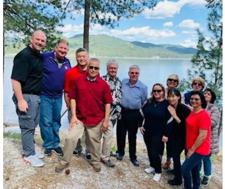
Northwest Division officers join in Leaders in Community gatherings at Camp Gifford.