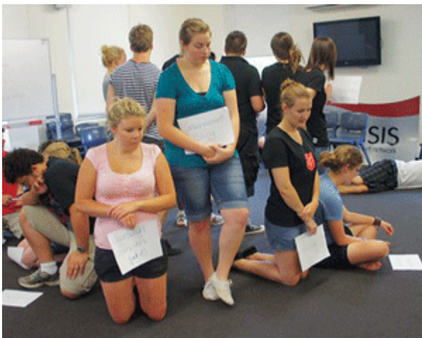
Delegates to the Take Time 2 Be Holy retreat held by the Australia East Territory

Such has been my experience and the experience of many over the past few years since the establishment in July 2008 of the Centre for Spiritual Life Development (CSLD) on the campus of the International College for Officers in London. Just the announcement of such a place, such a priority, has provided the opportunity for Salvationists to give voice to their hunger—hunger for the Lord, hunger for a fresh touch from the Holy Spirit, hunger for time to go deeper in Christ, in the Word, with the body, the people of God. And finding in that hunger, that others are hungry, too!